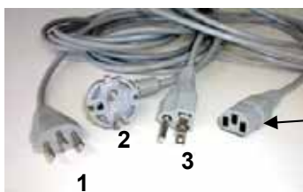
110 8568 Power cable CH : 1 110 8304 EU/Schuko : 2 111 1748 Japan and USA : 3