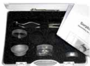
111 9979 SI Set Master