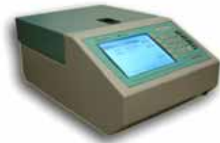
111 9971 LabMaster-aw "BASIC"