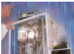
Prices see on the pricelist