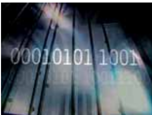
111 9976 License