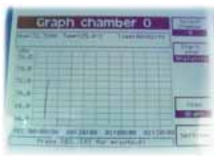
260 0275 Update package