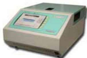
111 9974 LabPARTNER-aw