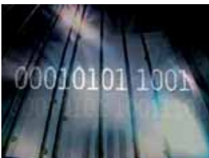
112 0171 License