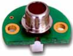
111 9983 CM-2 measuring cell