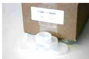
111 0601 ePW sample dishes