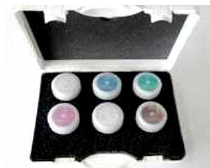
252 5418 Case with 6 Stk SAL-T for LabMaster and LabPartner-aw